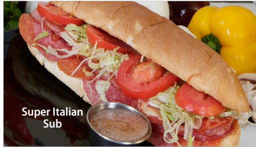
Super Italian Sub

Seasoned Ground Beef, Cheddar Cheese, Lettuce, Tomato & Taco Sauce $12.50 1118 cal