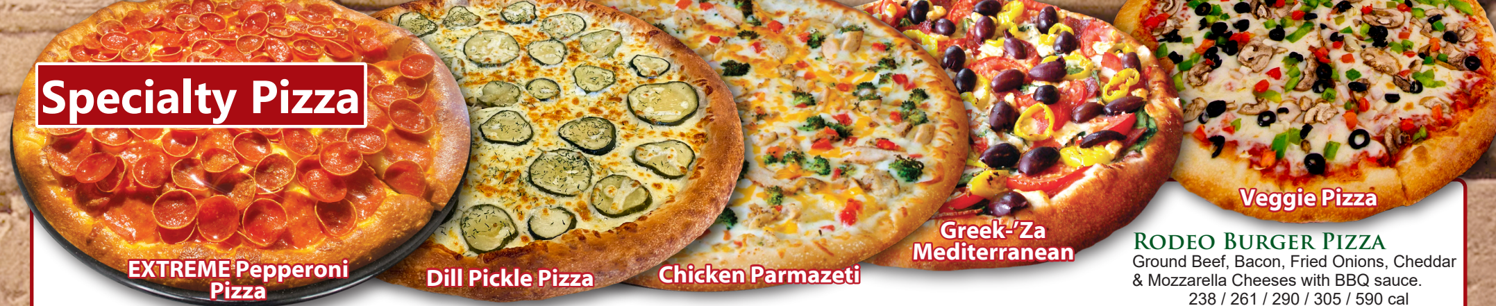
EXTREME Pepperoni Pizza