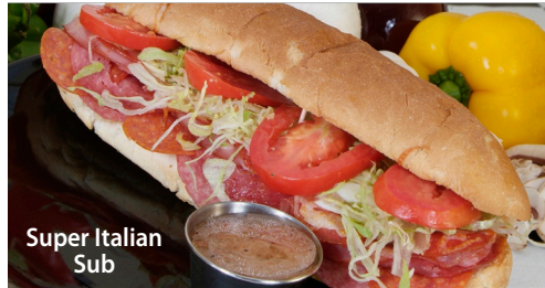
Super Italian Sub

Bacon, Lettuce, Tomato & Cheddar Cheese $9.50 1236 cal