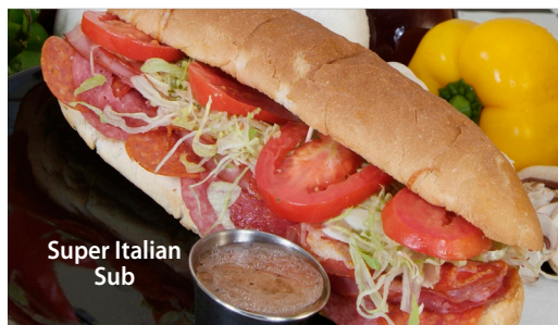
Super Italian Sub

Seasoned Ground Beef, Cheddar Cheese, Lettuce, Tomato & Taco Sauce $11.00 1118 cal